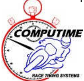
Clerk of Course - Paul Hinds

www.computime.com.au COMPUTIME RACE TIMING SYSTEMS PTY LTD